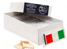
6mm Balsa / 50 packs of 20