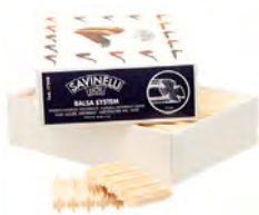
9mm Balsa / 200 Count

Savinelli's balsa filters provide a drier smoke by the simplest of means: absorbing moisture and condensation, along with impurities, from the smoke-stream. While many more complicated systems have come and gone, Savinelli's remains, and remains popular, being both effective and very inexpensive.