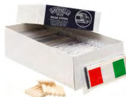
9mm Balsa / 30 packs of 15