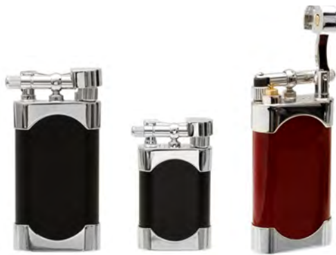
Mikazuki Black Black Short Red