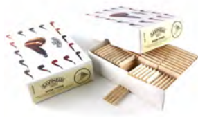
6mm Balsa / 300 Count