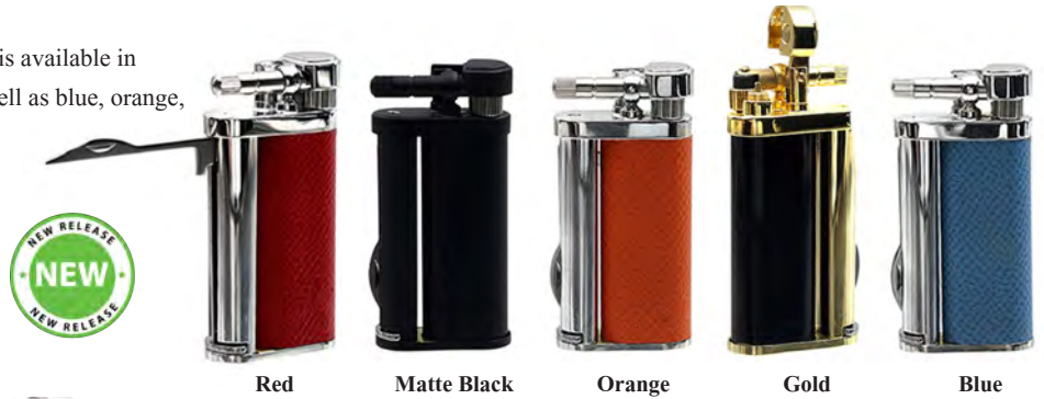
Red Matte Black Orange Gold Blue

A pipe smoker's best friend, the Kiribi Tomo is available in understated black matte and dressy gold, as well as blue, orange, and red leather varieties.