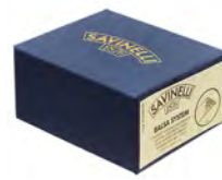
6mm Balsa / 100 Count