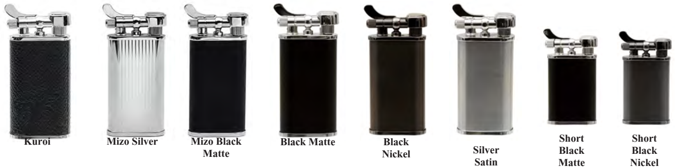
Kuroi Mizo Silver Mizo Black Matte Black Matte Black Nickel Silver Satin Short Black Matte Short Black Nickel

Modern engineering in an Art-Deco retro-chic style, the Kabuto is one of Kiribi's most popular and unique offerings. Its defining feature is perhaps its iconic cap toggle, shaped to resemble the wings of a samurai's "kabuto" battle helm. Kiribi Kabutos boast innovations such as a capacious, single-tank fuel reservoir, a binary flame design, which covers a wider surface while being gentler to your customers' pipe, and a hinge spring made of a special polymer that is far more resistant to fatigue than steel.